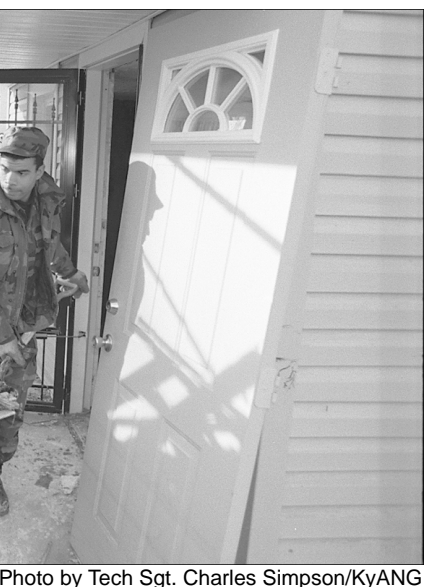
23rd Civil Engineering Squadron unty Kentucky.